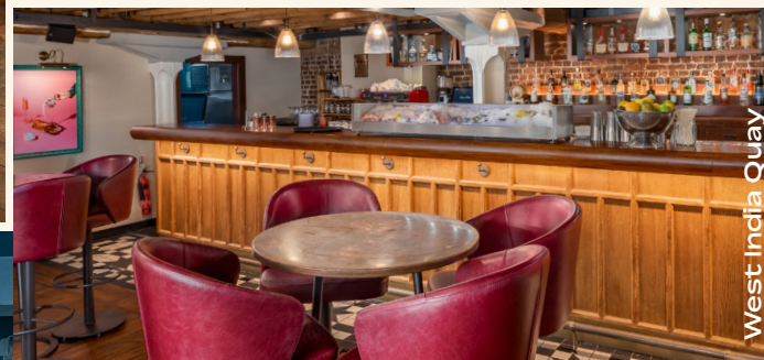
West India Quay